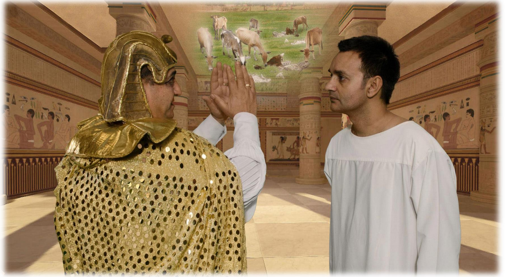
The Pharaoh tells his dreams to Joseph