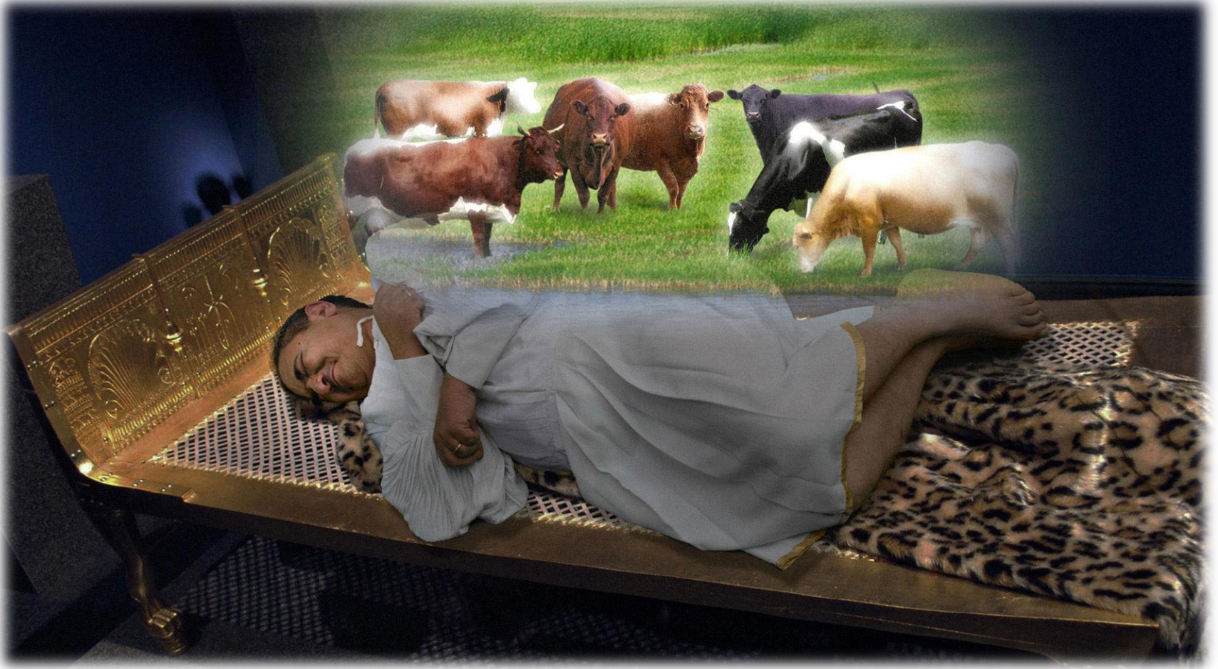
Pharaoh had a dream with 7 healthy fat cows that are among the reeds