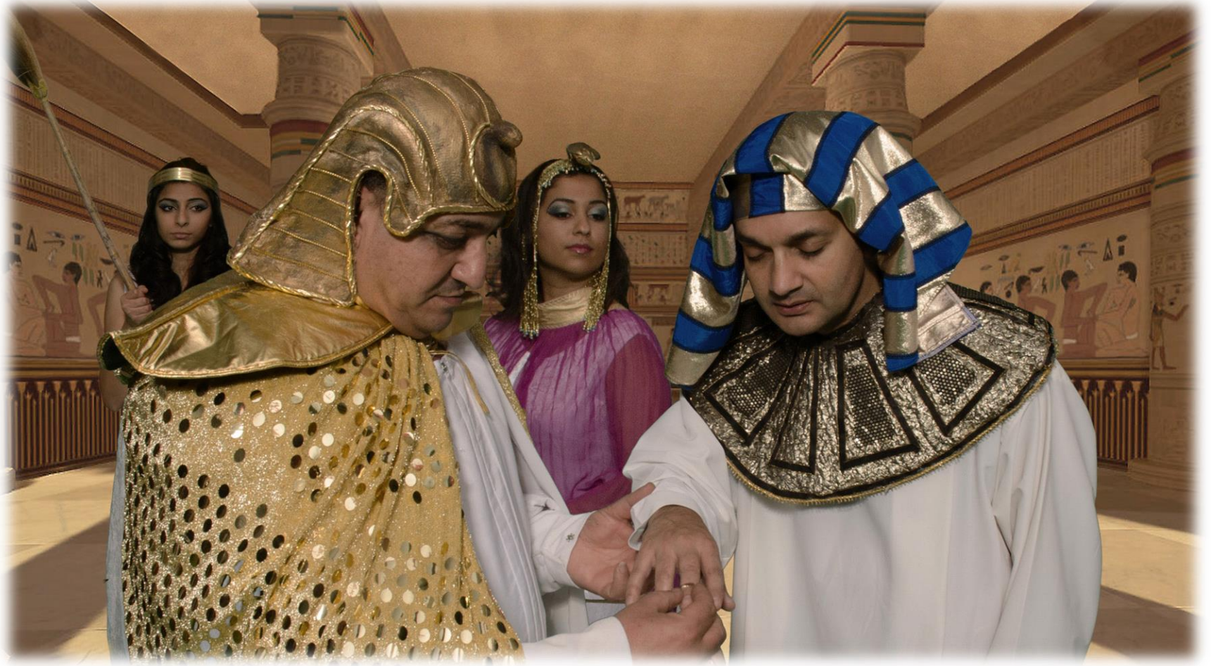
Pharaoh appoints Joseph as his second in command