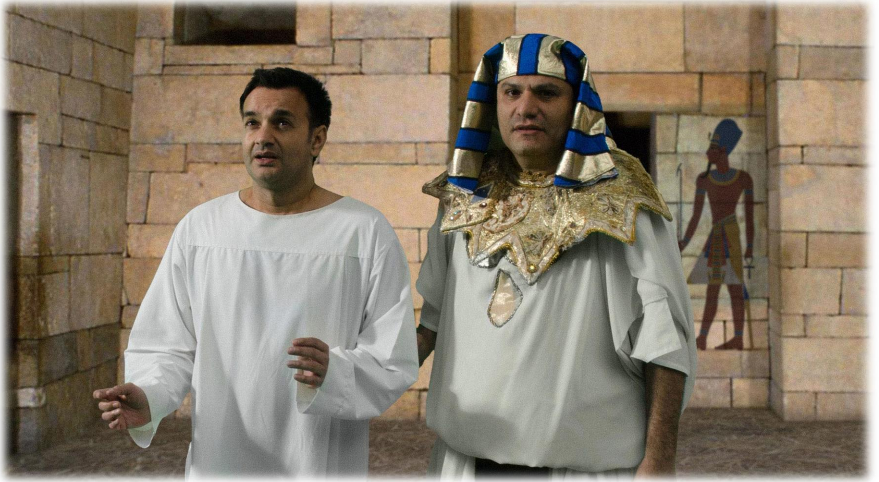
Joseph is brought to the Pharaoh