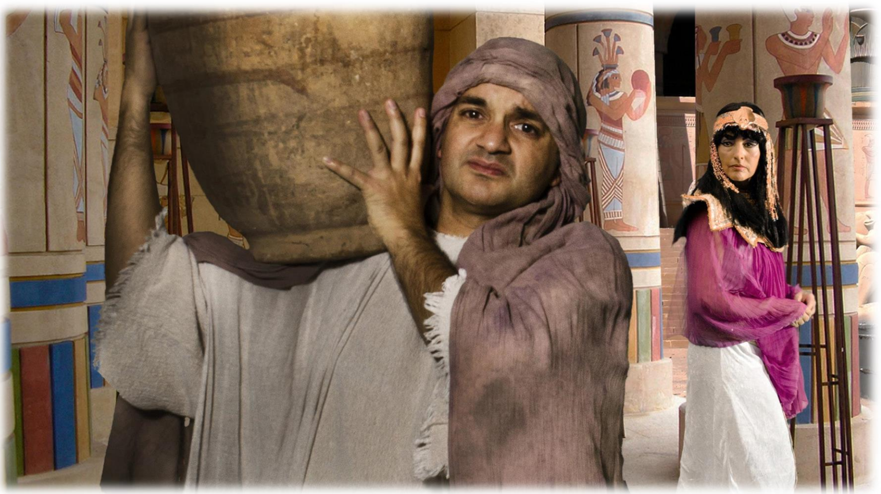
Potiphar put Joseph in charge of his household