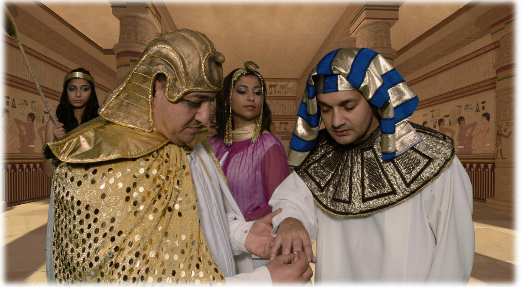
Pharaoh appoints Joseph as his second in command