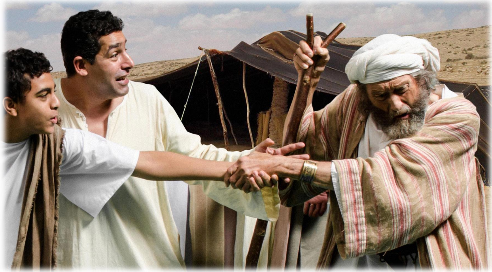
Jacob refused to allow Benjamin to go to Egypt