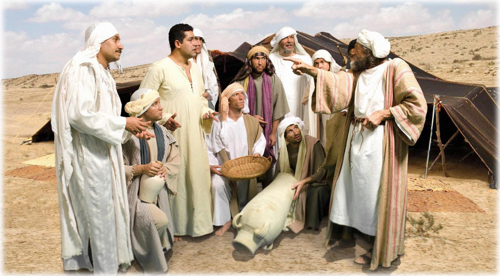
Jacob learns there is grain in Egypt and sends his sons to buy grain