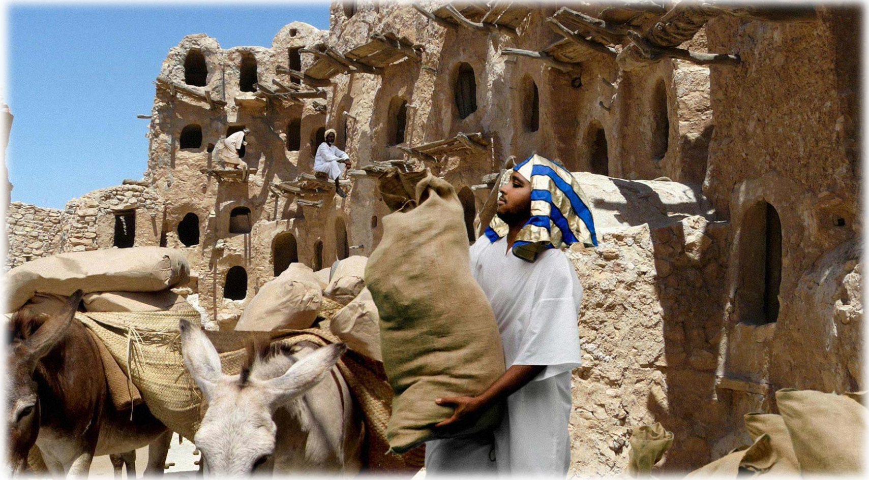
They loaded their grain and left